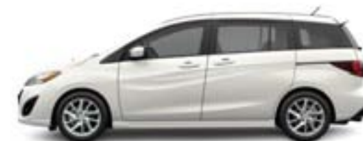
Crystal White Pearl