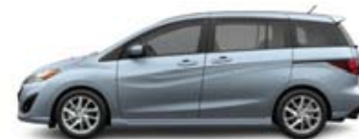
Clearwater Blue Mica