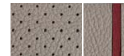
Sand Leather with Red Piping