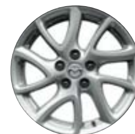
17" alloy wheels (GT)