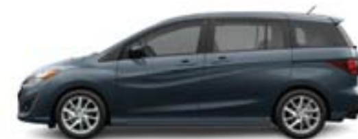
Metropolitan Grey Mica