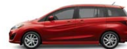
Copper Red Mica