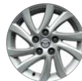
16" alloy wheels (GS)