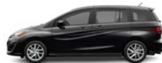
Brilliant Black Mica