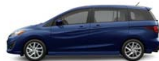
Stormy Blue Mica