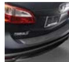
Rear bumper guard