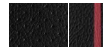
Black Leather with Red Piping