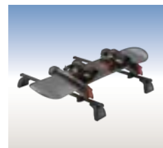
Roof rack ski/ snowboard carrier