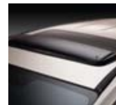
Moonroof wind deflector