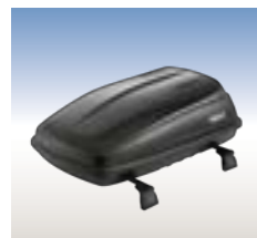
Cargo box - Small